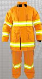
HEAT RESISTANT SUITE