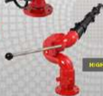
HIGH FLOW RATE